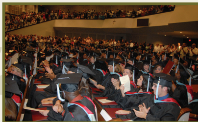
Friends & families give the graduates a standing ovation for their hard work at the end of the August graduation ceremony.