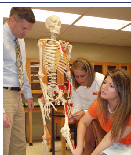
Students study in the A&P Lab

AS YOU MAY HAVE HEARD, Union began its new program in pharmacy in the fall of 2007. What you may not have considered is how much this new program is affecting the Biology Department. Due to exciting changes in the field of pharmacy, doctors of pharmacy are taking more active roles