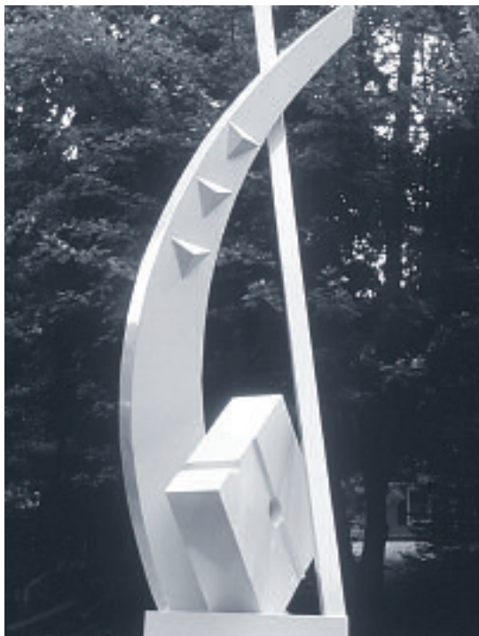
Reaching for the Sun