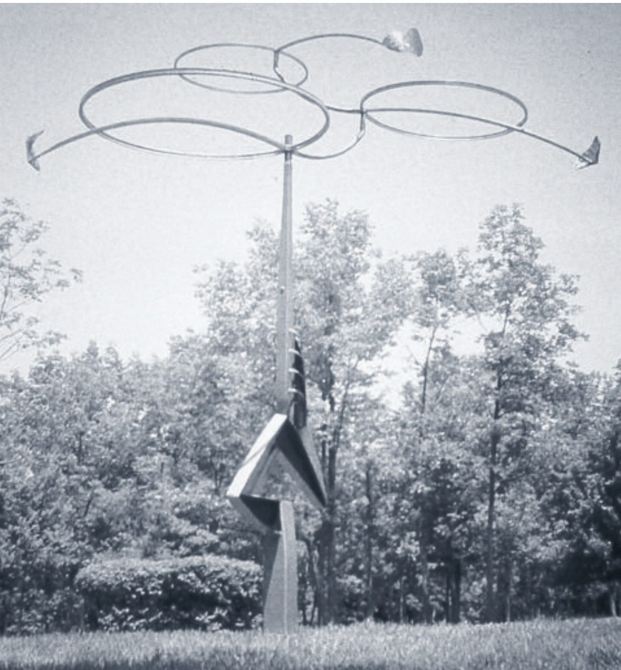
The Watchtower 16' x 20' diameter