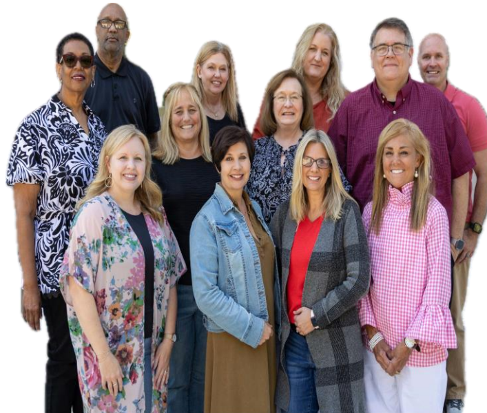
School of Social Work Faculty and Staff

Check out our website at www.uu.edu/adultbsw . | Facebook: Union University School of Social Work | Instagram: @uusocialwork