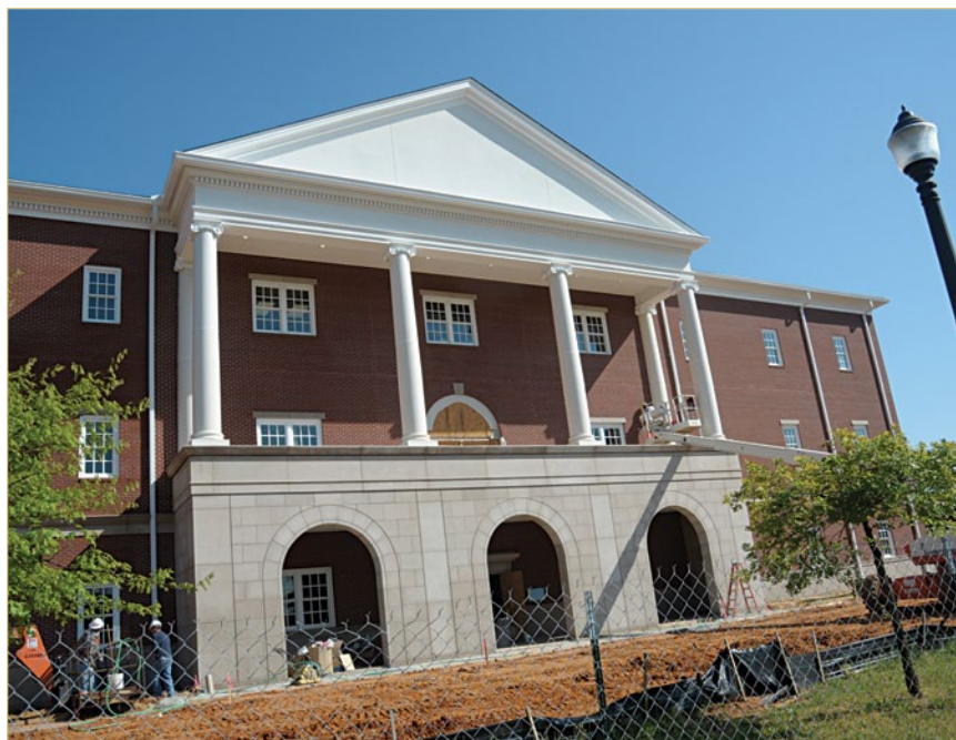
New Providence Hall under construction on the west side of campus will house the School of Pharmacy.