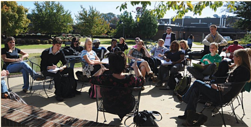
Union receives national attention for "an unusual commitment to undergraduate teaching."