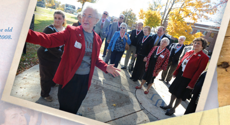
The Class of '59 toured the old campus during homecoming 2008.